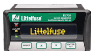
AC/DC Earth Leakage